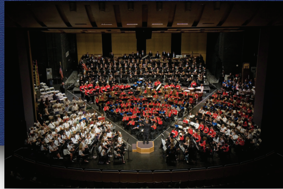
Performances in assemblies and concerts, including at the Civic Arts Plaza!

All interested students in Grades 4 and 5 can choose from the flute, clarinet, alto saxophone, trumpet, or percussion!